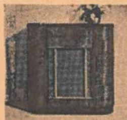
MODEL EK-102 • Modern, beautifully styled phonograph-radio. Brilliant FM (Frequency Modulation) and AM performance. High fidelity tone. Silent magnetron record changer plays 12 ten-inch or 10 twelve-inch records. Choice of walnut or blond mahogany cabinet.