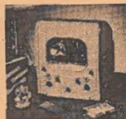
TELEVISION TABLE MODEL • The hit of the New York Television Show, brilliantly engineered by Farnsworth, television's pioneer. Sharp, clear pictures on 16-inch direct view, semi-flat face tube. AM radio also available. Compact, modern cabinet in regular, or blond mahogany.

Whether you enjoy the sparkle and drive of today's popular music, or the flooding richness of the symphony, you'll like the way each is re-created in your home by the new Farnsworths. These truly post-war instruments are endowed with a full, vibrant tone that brings you recorded and broadcast music of surpassing clarity. All incorporate new electronic advances, and the phonograph-radios are equipped with an improved automatic record changer that is quick, quiet and gentle. Cabinets range from smart portables to luxurious phonograph-radios—all combining quality with modest price (ranging from $125 to $400). Hear the new Farnsworth today at your nearest Farnsworth dealer. He is one of a limited number carefully selected because of his integrity, his willingness and ability to render proper service. You'll find him friendly and informed, and anxious to help you in every way.