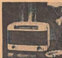
MODEL ET-801 • Smart, handsome table radio. Luxurious ivory plastic cabinet with contrasting grille in blue, maroon or black. Features brightly illuminated Farnsworth treble dial. Standard and foreign reception. Built-in loop antenna. Set operates on either AC or DC current.