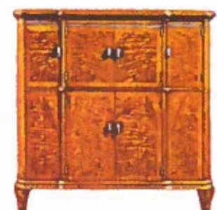
THE CAPEHART ADAM

FARNSWORTH TELEVISION & RADIO CORPORATION